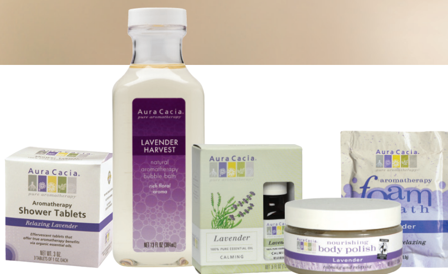
Essential Oils • Body Washes • Mineral Baths • Foam Baths Body Scrubs • Bubble Baths • Shower Tablets

*Source: Aromatherapy & Bath Category SPINS data 52 weeks ending 6/12/2010